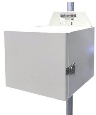
ENC-AL-12x14x15 Aluminum Enclosure