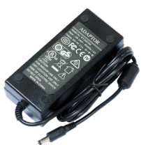
24V 2.5A Power adapter