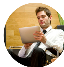
Remote Office Connectivity