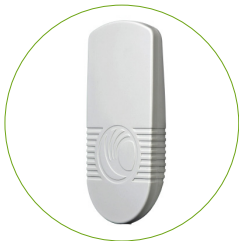
ePMP 1000 Integrated Radio