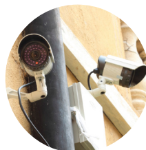
Video Surveillance Backhaul