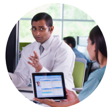
Primary or Redundant Connectivity