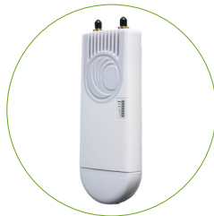
ePMP 1000 Connectorized Radio Synchronized and Unsynchronized models