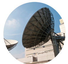
Leased Line Replacement